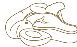
FRESH GROCERIES FROM THE SUPERMARKET