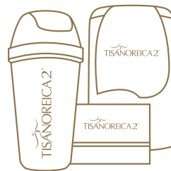
TISANOREICA® PRODUKTE & AKTIVATOR